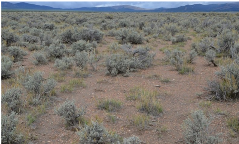
Figure 9. P. Novak-Echenique_9/2013

Wyoming big sagebrush and seeded wheatgrass species co-dominate. Annual non-native species stable to increasing.