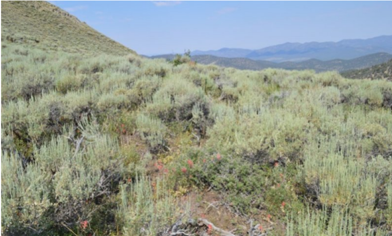
Figure 8. Calcareous Loam 16+" (R028BY085NV) T. Stringham July 2013