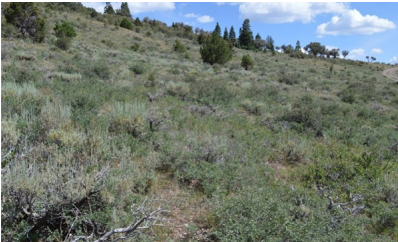
Figure 9. Calcareous Loam 16+" (R028BY085NV) T. Stringham July 2013

Mountain big sagebrush increases in the absence of disturbance or with grazing management that favors shrubs. Decadent sagebrush dominates the overstory and the deep-rooted perennial bunchgrasses in the understory are reduced either from competition with shrubs or from grazing management.