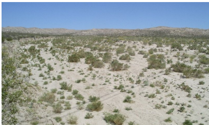
Figure 2. Sandy Wash

The interpretive plant community is the reference plant community prior to European colonization. This plant community is dominated by California broomsage. Minor species include California buckwheat ( Eriogonum fasciculatum ), burrobrush ( Hymenoclea salsola ), and desert senna ( Senna armata ). The vegetation is important for trapping the sediment that water carries into the drainageway. The regular disturbance to this ecological site may prevent other species from establishing in large numbers. This ecological site is approximately 95% shrubs.