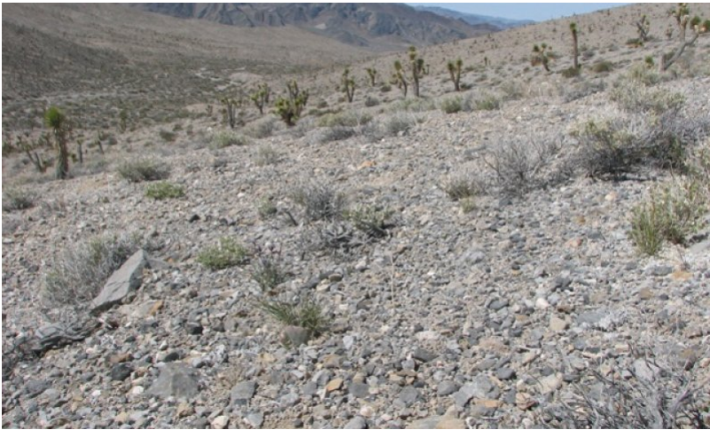
Figure 2. Loamy Hill

The reference plant community is dominated by shadscale. Indian ricegrass, big galleta and ephedra are important associated species. Potential vegetative composition is about 10 percent grasses, 5 percent forbs and 85 percent shrubs. This plant community is sparsely vegetated with approximate ground cover (basal and crown) 2 to 10 percent.