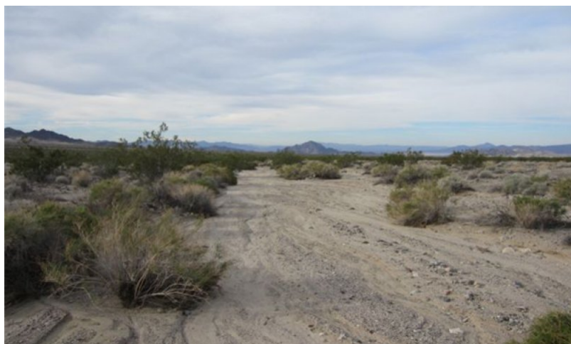
Figure 2. Community Phase 2.1

This community phase is dependent upon unimpaired hydrologic function and average to above average precipitation conditions. There are two community components associated with this community phase. Community component one is in the most actively flooded region of the drainageway, which is composed of barren sands and gravels. Community component two is adjacent to the active zone in the drainageway and on inset fans and sideslopes of the drainageway. White burrobush is generally dominant, and creosote bush and burrobush are common secondary shrubs. Desertsenna is often present but not abundant. Native annual forbs are present with adequate precipitation, and common species include desert Indianwheat ( Plantago ovata ), cryptantha ( Cryptantha sp.), sandmat ( Chamaesyce sp.), pincushion flower ( Chaenactis fremontii ), and birdcage evening primrose ( Oenothera deltoids ). The non-native annual grass Mediterranean grass is naturalized in this plant community.