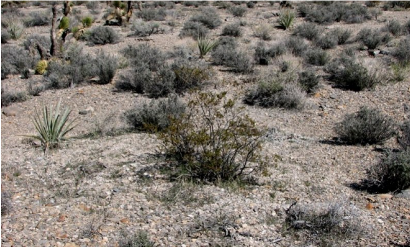
Figure 3. Invaded State - trace of red brome

Compositionally this plant community is similar to the reference plant community with the presence of non-native species in the understory. Ecological processes have not been compromised at this time. However, ecological resilience is reduced by the presence of non-natives. This plant community may respond differently following a disturbance, when compared to the reference plant community. Management focused on protecting intact blackbrush communities is important to ensure seed sources are available for regeneration in the future.