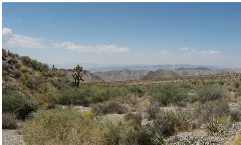
Figure 2. Gravelly Wash

The reference plant community is characteristic of a healthy, mid to late-seral plant community phase. Dominant plant species include desert almond, Fremont's dalea and white burrobush. Nevada ephedra and Yucca species are other important species associated with this ecological site. Potential vegetative composition is about 10 percent grasses, 10 percent forbs and 85 percent shrubs. Approximate ground cover (basal and crown) is 15 to 35 percent. Annual natives are abundant in years with increased spring time precipitation.