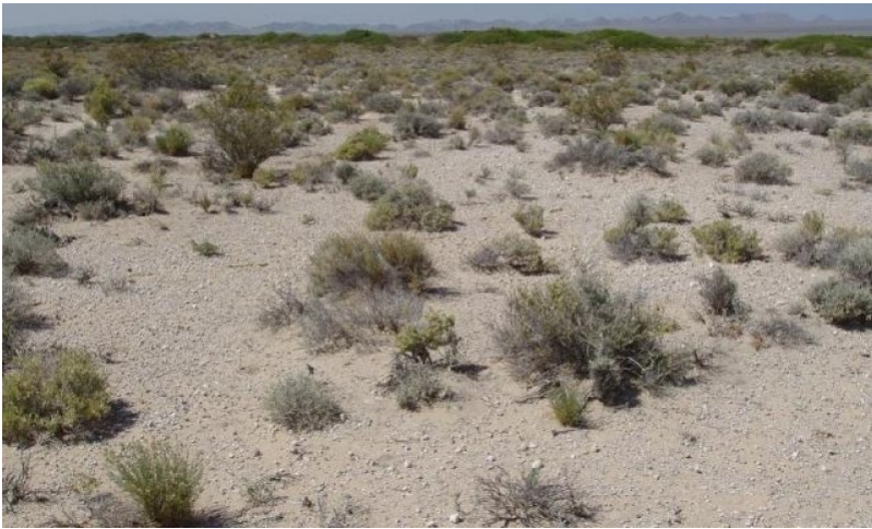
Figure 2. Calcareous Loam

The reference plant community is dominated by shadscale, white bursage and creosotebush. Potential vegetative composition is about 10 percent grasses, 10 percent perennial and annual forbs and 80 percent shrubs. Approximate ground cover (basal and crown) is less than 10 percent (~6 percent). The reference plant community is representative of a healthy climax condition.