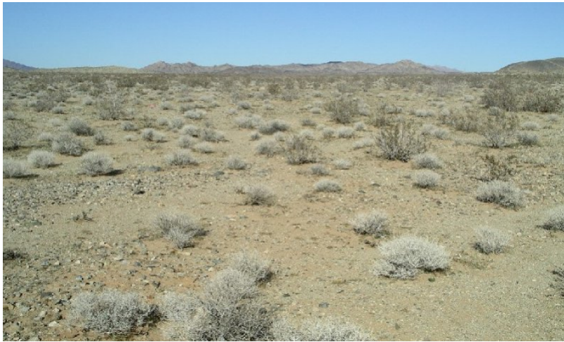
Figure 4. Community Phase 2.1

The reference community for this ecological site is almost exclusively composed of low-growing creosote bush ( Larrea tridentata ) and burrobush ( Ambrosia dumosa ), with lesser dominants including white ratany and littleleaf ratany ( Krameria grayi and K. erecta ), Mojave yucca ( Yucca schidigra ), chollas ( Cylindropuntia spp.), cacti ( Echinocereus spp. and Ferocactus cylindraceus ), ephedras ( Ephedra spp.) and a sparse understory composed primarily of the annual forbs, curvenut combseed ( Pectocarya recurvata ), pincushion flower ( Chaenactis fremontii ) and desert calico ( Loeseliastrum matthewsii ). The community is characterized by its low production, with 3-4 foot-tall creosote bush ( Larrea tridentata ), but high abundance of burrobush.