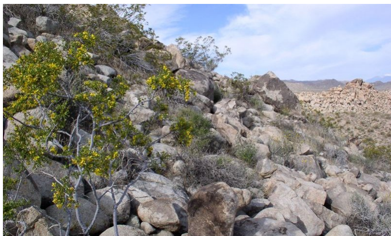
Figure 4. Community Phase 2.1

This community represents the current potential plant community for this ecological site. Creosote bush and Parish's goldeneye weakly dominate the site, with a high diversity of secondary shrubs and perennial forbs. Secondary shrubs typically present include Nevada jointfir ( Ephedra nevadensis ), eastern Mojave buckwheat ( Eriogonum fasciculatum ), and jojoba ( Simmondsia chinensis ). Subshrubs include desert trumpet ( Eriogonum inflatum ), wishbone bush ( Mirabilis laevis var. villosa ) and desert globemallow ( Sphaeralcea ambigua ). Native and non-native winter annuals are seasonally abundant during wet years, and especially where additional run-off occurs.