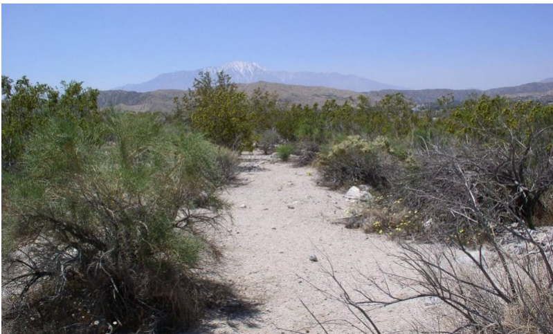
Figure 6. CC2, high production

This community phase is dependent upon unimpaired hydrologic function and average to above average precipitation. At any given point along the stream the following community components are generally present. The