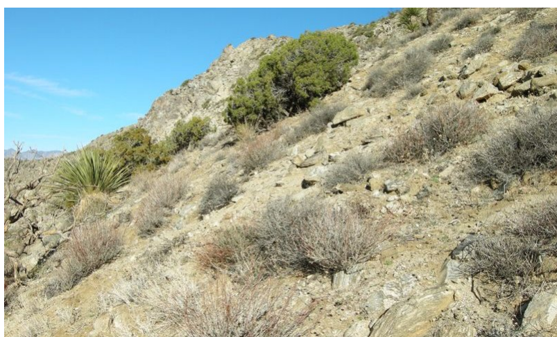
Figure 5. Community Phase 2.1

The reference plant community is dominated by eastern Mojave buckwheat and California juniper, and desert needlegrass is an important species. Trace cover of single-leaf pinyon pine ( Pinus monophylla ), Joshua tree ( Yucca brevifolia ) and Muller's oak may be present. Secondary shrubs may include bastardsage ( Eriogonum wrightii ), green rabbitbrush ( Ericameria teretifolia ), blackbrush, Parish's goldeneye ( Viguiera parishii ) and Mojave yucca ( Yucca schidigera ). Subshrubs typically present include wishbone-bush ( Mirabalis laevis var. villosa ) and shrubby deervetch ( Lotus rigidus ). Winter annuals typically seasonally present are likely to include chia ( Salvia columbariae ), pincushion flower ( Chaenactis fremontii ) and bristly fiddleneck ( Amsinckia tessellata ). The non-native annual grasses red brome and cheatgrass are often abundant in this site.