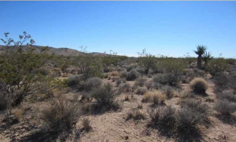
Figure 2. Community Phase 2.1

This is the representative state for this ecological site. It is similar in composition to the reference state, but non-native species are present, perennial grasses may be less abundant, and livestock grazing and high severity, large fires introduce new ecological dynamics.