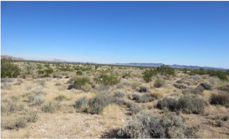
Figure 4. Community Phase 2.2