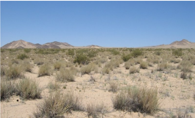
Figure 5. Community Phase 2.1

State 2 represents the current range of variability for this site. Non-native annuals, including Mediterranean grass and Asian mustard are naturalized in this plant community. Their abundance varies with precipitation, but they are at least sparsely present (as current year's growth or present in the soil seedbank).