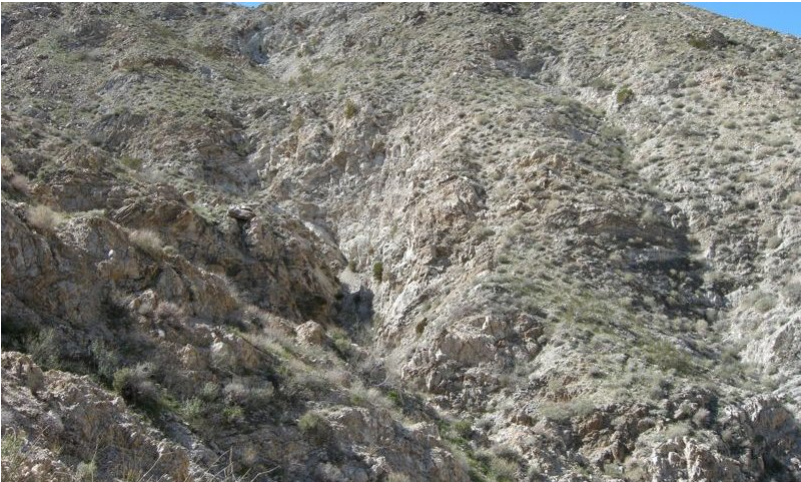
Figure 5. Community Phase 2.1

State 2 represents the current range of variability for this site. Non-native annuals, including red brome, Mediterranean grass, and red-stem stork’s bill ( Erodium cicutarium ) are naturalized at low levels in this plant community.