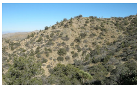
Reference Plant Community