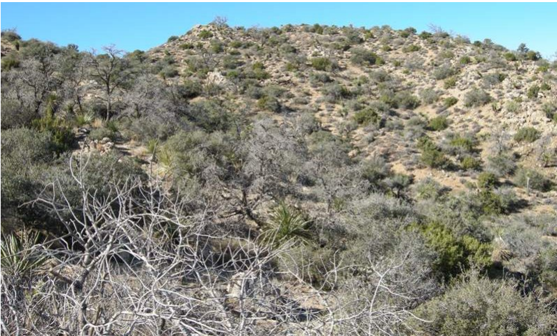
Figure 7. Community Phase 2.2