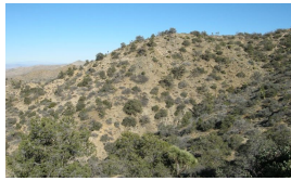
Reference Plant Community

This pathway occurs with time and a return to average or above average precipitation. The presence of mutualistic animal species, live mature pinyon, and nurse plants will enhance singleleaf pinyon recovery. Singleleaf pinyon reaches reproductive maturity in approximately 35 years (Evans 1988; Meeuwig et al. 1990).