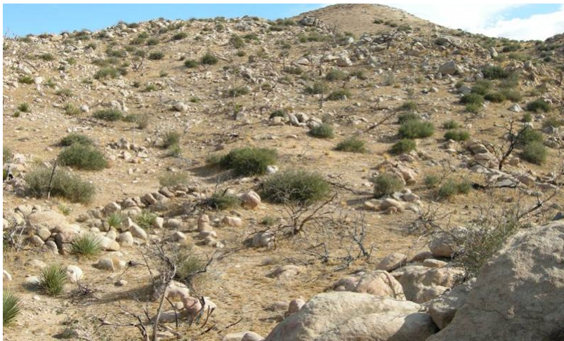
Figure 8. Community Phase 3.1