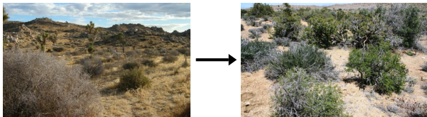
Fire regeneration community