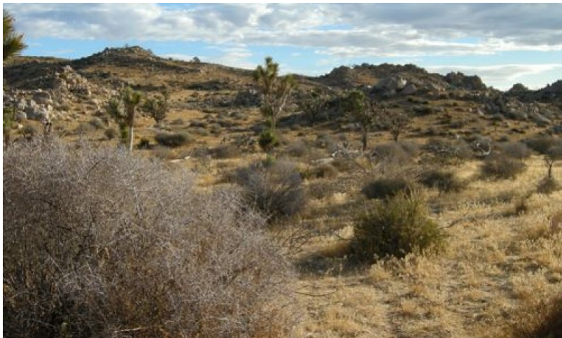
Figure 7. Community Phase 2.3