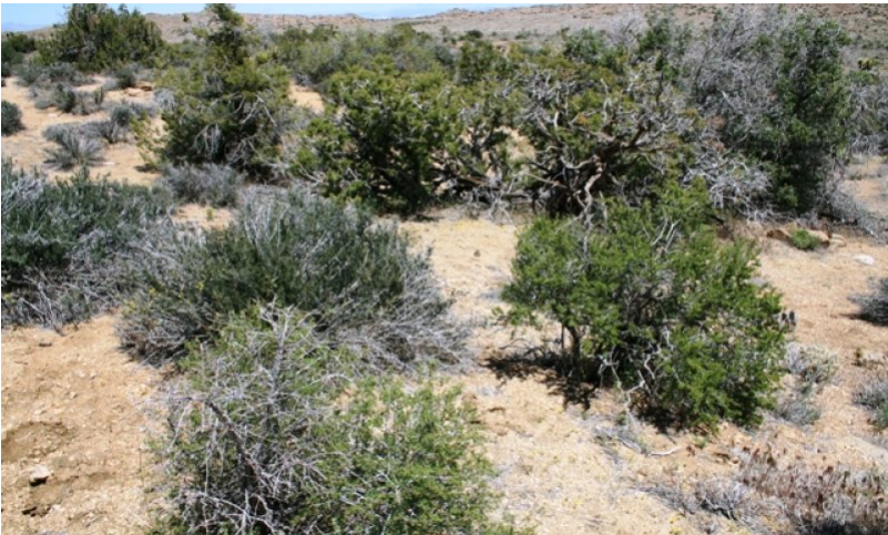
Figure 5. Community Phase 2.1

State 2 represents the current range of variability for this site. Non-native annuals, including red brome and cheatgrass are naturalized in this plant community. Their abundance varies with precipitation, but they are at least sparsely present (as current year’s growth or present in the soil seedbank).