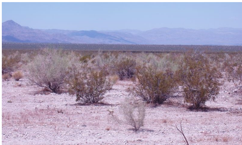
Figure 5. Community Phase 2.1