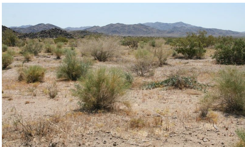
Figure 6. Community Phase 2.1