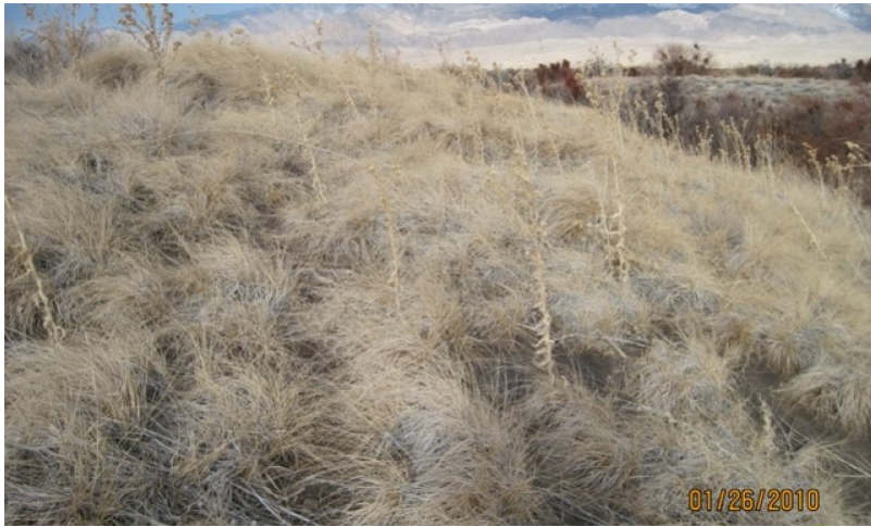
Figure 2. Spring Mound

The plant community is dominated by alkali sacaton, rush species, and inland saltgrass. Potential vegetative composition is about 88% grasses, 10% forbs, and 2% shrubs. Approximate ground cover (basal and crown) is about 45 to 70 percent. This plant community is representative of a healthy late seral stage.