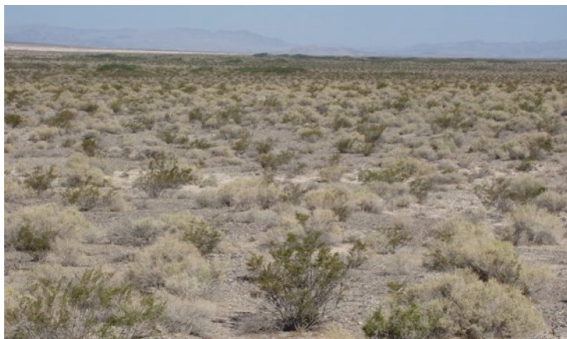
Figure 3. Test

This plant community is similar to the reference plant community with a trace of non-natives in the understory. Ecological processes have been not compromised by the presence of non-native species at this time, however, ecological resilience is reduced. Creosotebush and cattle saltbush persist through invasion by non-native annuals, however, native forbs and grasses are at a competitive disadvantage and suffer reduced vigor and reproductive capacity.