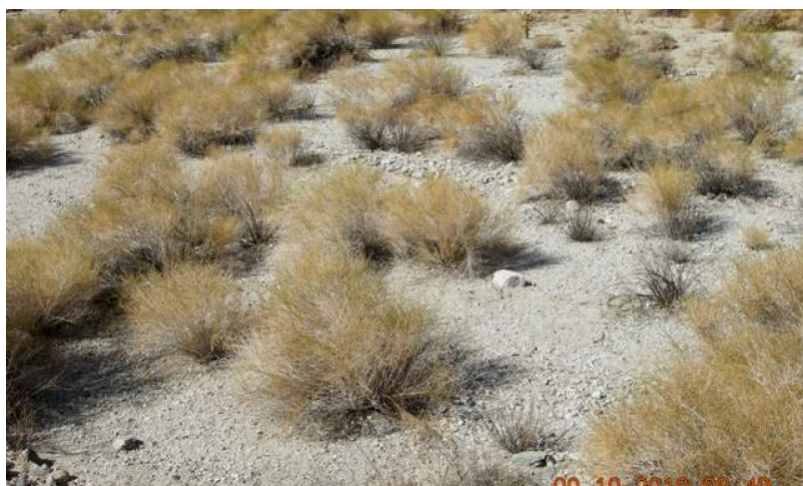
Figure 6. Active channel on lower fans