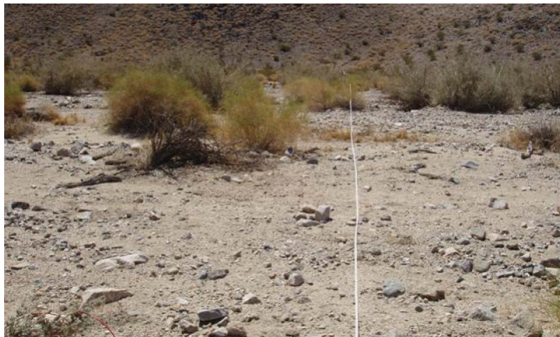
Figure 5. Active channel on upper fans