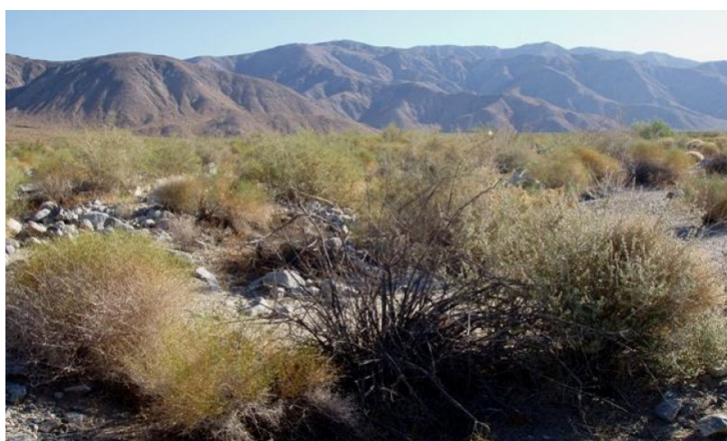
Figure 7. Mixed shrubs on lower fan

This community phase is dependent upon unimpaired hydrologic function and average to above average precipitation. At any given point along the stream the following community components are generally present. The relative spatial extent of these communities varies as the channel morphology fluctuates from flash flood events.