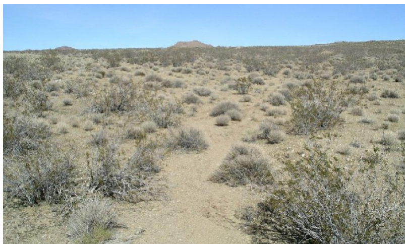
Figure 4. Community Phase 2.1

The reference plant community is characterized by an open canopy of widely spaced shrubs 1 to 1.5 meters tall. Creosote bush and desertsenna dominate, and burrobush is an important secondary shrub. Potential vegetative composition is 5% grasses, 5% forbs and 90% shrubs. A relatively high diversity of minor shrub species may be present, including but not limited to white ratany ( Krameria grayi ), cottontop cactus ( Echinocactus polycephalus ), Wiggins cholla ( Cylindropuntia echinocarpa ), and Mojave yucca ( Yucca schidigera ). Native forbs are abundant with above average precipitation, and common species include smooth desert dandelion ( Malacothrix glabrata ), bristly fiddleneck ( Amsinckia tessellata ), chia ( Salvia columbariae ), and pincushion flower ( Chaenactis ). The non-native annual forb redstem stork's bill may be relatively abundant, and the non-native annual grass common Mediterranean grass may be sparsely present.