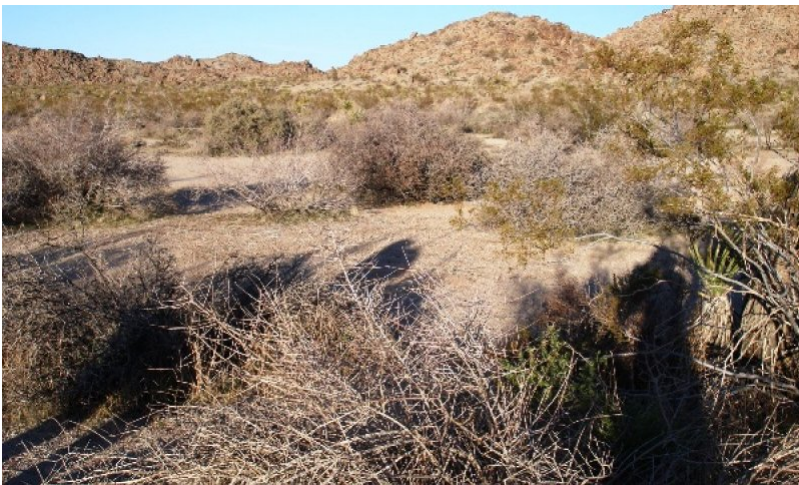
Figure 6. Adjacent to main channel