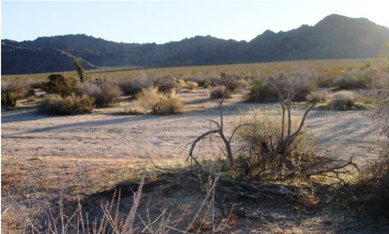
Figure 5. Main channel