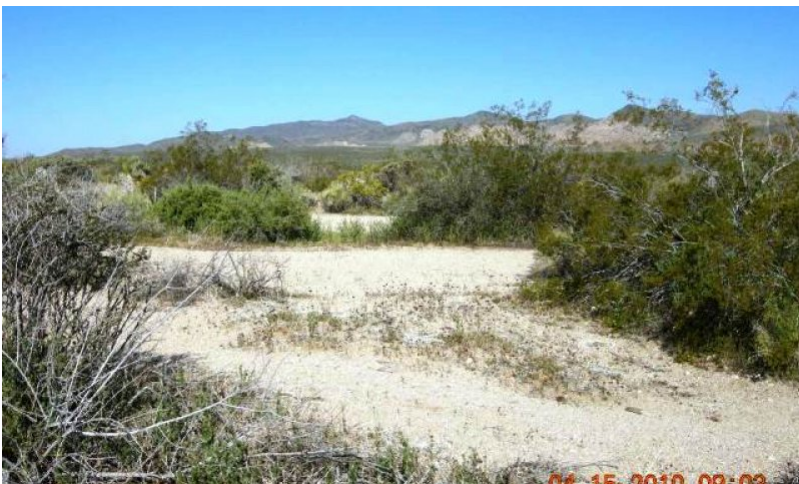
Figure 7. Side channels and upper fans