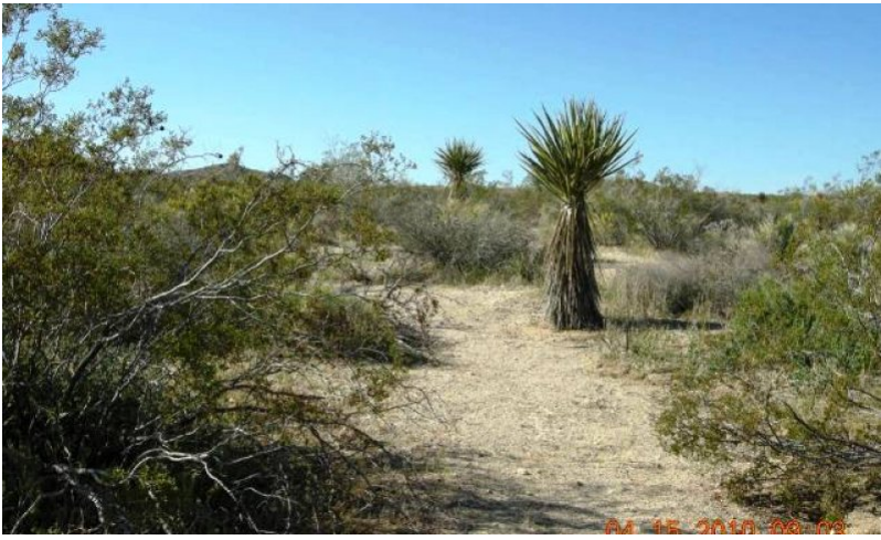
Figure 8. Stable areas and upper bars