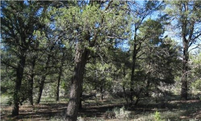
Figure 5. Clay Loam Upland, 13-17"p.z.

On this forested site, pinyon and juniper trees dominate the overstory with shrubs and grasses in the understory.