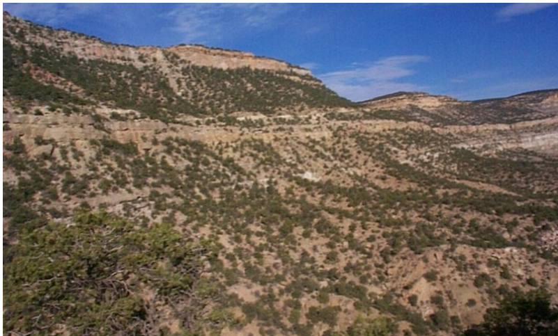
Figure 5. Colluvial Slopes 13-17" p.z

This forest plant community is dominated by a canopy cover of 35-50% trees such as Colorado pinyon, at 80% dominance, and Utah juniper at 20%. The understory is dominated by shrubs like mountain-mahogany & Utah serviceberry with some perennial grasses like muttongrass & Indian ricegrass, forbs, succulents and young trees.