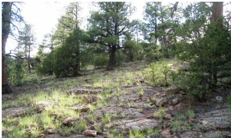
Figure 5. Sandstone hills 17-25" p.z. (PIPO)

This plant community is dominated by mature ponderosa pine with 20 to 35% canopy cover. Cover may be as high as 50% on north facing slopes with 10 - 20% cover of shorter ponderosa pine, Colorado pine, juniper and Gambel oak in the understory. Shrubs are small (<1 m), scattered and make up less than 2% cover. These include Fendler ceanothus and creeping barberry. Grass and forb species range from 5% to 30% cover with lower cover values in areas of dense tree canopy cover and/or bedrock. Perennial grasses are dominated by mountain muhly and blue grama. Perennial forbs are secondary to grasses.