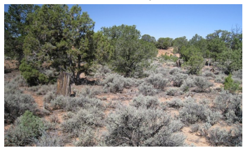
Figure 4. Sandy Upland 13-17" p.z. Moderately Deep

The aspect of this site is a mix of Colorado pinyon and Utah juniper with scattered Gambel oak and an occasional ponderosa pine. Common understory plants include greenleaf manzanita, Utah serviceberry sandhill muhly, blue grama and Indian ricegrass.