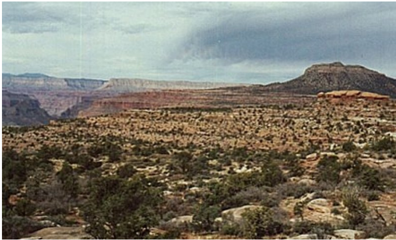
Figure 5. 35.3 Sandstone upland 10-14" p.z.

The dominant aspect of this site is a grassland and shrub mix with scattered Utah juniper and/or Colorado Pinyon. Major grassses are Indian ricegrass, needle and thread, blue grama and galleta. Shrubs include Bigelow sagebrush, antelope bitterbrush, stansbury cliffrose and green mormon tea. There may trace amounts of non-native annuals present. Plant species most likely to increase or invade on this site are cheatgrass, thrifty goldenweed, stemless goldenweed, annual weeds, broom snakeweed, Greene rabbitbrush Bigelow rubber rabbitbrush and Bigelow sagebrush. Continuous grazing during the winter and spring will decrease cool season grasses which are replaced by lower forage value grasses and forbs.