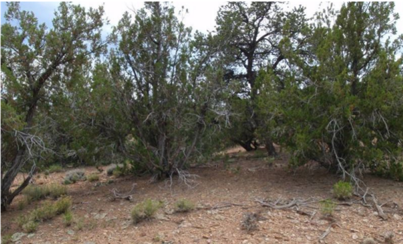
Figure 5. 35.3 Sandstone Upland 10-14" p.z.

weedy forbs, broom snakeweed, Greene rabbitbrush and Bigelow sagebrush. Unmanaged grazing during the winter and spring periods will decrease cool season grasses which are replaced by lower forage value grasses and forbs.