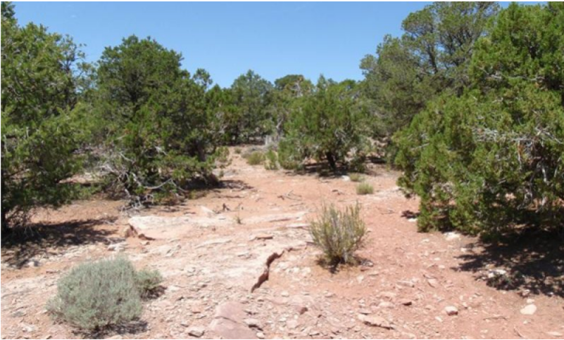
Figure 6. 35.3 Sandstone upland 10-14" p.z.

In this plant community the site is characterized as a forestland with an understory dominated by perennial grasses with scattered shrubs and a few perennial forbs. The tree canopy ranges from 25-35% with Utah juniper and Colorado pinyon as major overstory species. The understory is mostly Indian ricegrass, New Mexico feathergrass, blue grama, needle and thread, Bigelow sagebrush and Stansbury cliffrose.