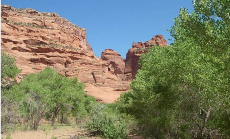
Figure 5. Sandy Loam Bottom

The Historic Climax Plant Community (HCPC) is dominated by a canopy of Rio Grande cottonwood ( Populus deltoides ssp. wislizenii , with lesser amounts of red willow ( Salix laevigata ) and other native willows. The understory is a mix of shrubs such as redosier dogwood ( Cornus sericea ) and chokecherry ( Prunus spp.) with cool-season and warm season grasses and forbs. Overstory canopy cover can come close to 90 percent, but will fluctuate with flood events under natural conditions. These fluctuations allow gaps in the canopy that are important for the recruitment of young cottonwoods and willows into the overstory.