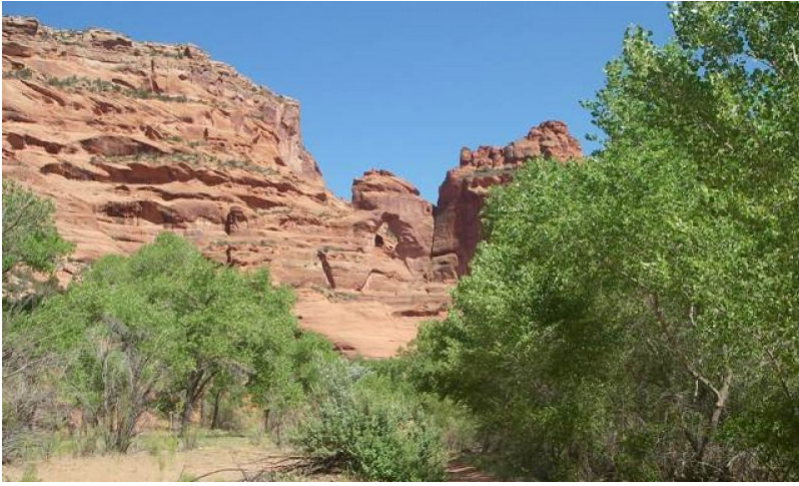
Figure 5. Sandy Loam Bottom

The Historic Climax Plant Community (HCPC) is dominated by a canopy of Rio Grande cottonwood ( Populus deltoides ssp. wislizenii , with lesser amounts of red willow ( Salix laevigata ) and other native willows. The understory is a mix of shrubs such as redosier dogwood ( Cornus sericea ) and chokecherry ( Prunus spp.) with cool-season and warm season grasses and forbs. Overstory canopy cover can come close to 90 percent, but will fluctuate with flood events under natural conditions. These fluctuations allow gaps in the canopy that are important for the recruitment of young cottonwoods and willows into the overstory.