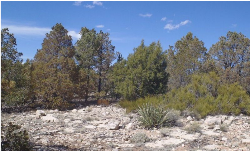
Figure 6. Limestone Upland 13-17" p.z. Phase 1.2

This site has an overstory comprised of pinyon pine (30%) and juniper (70%). The tree canopy cover is generally 40-55%, but can be higher. The understory is comprised of approximately 60% shrubs, 30% grasses and 5% each small trees and forbs. Understory species include sideoats grama, muttongrass, blue grama, penstemon, Stansbury cliffrose, turbinella oak and desert ceanothus. Non-native plant species may be present in minor amounts. Once non-native plants are introduced into the plant community, it is very difficult to eliminate these plants from the site.