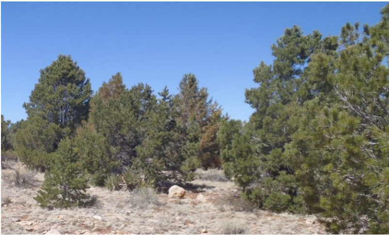
Figure 5. Limestone Upland 13-17" p.z. Phase 1.1