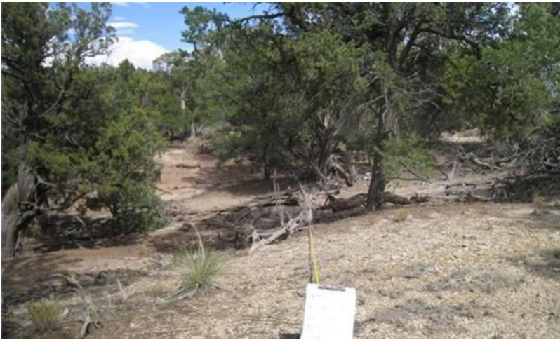
Figure 5. Sandstone Upland 13-17" p.z.

Trees dominate the overstory, but shrubs and grasses are common in the understory. The native overstory canopy is generally 40-50%, but can range from 25-65%. Pinyon pine dominates the canopy at higher elevations and has a more even composition at lower elevations. The understory plant community composition is comprised of about 20% grasses, 55% shrubs, 5% forbs and 20% trees (under 4.5 feet tall). Dominant grasses are muttongrass, squirreltail, blue grama, Indian ricegrass with big sagebrush, green mormon tea, cliffrose and snakeweed.