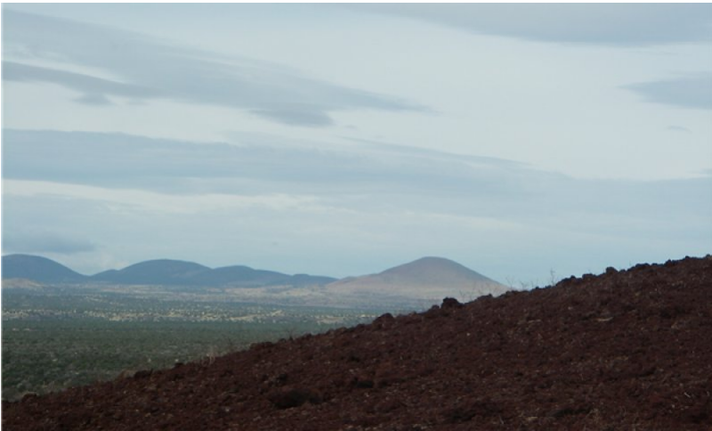
Figure 5. Non-Vegetated Cinder Hills

This community phase has essentially no vegetation. This is an early colonization area, and somewhat erosive, making it difficult to have established plants on the sideslopes and summits of cindercones.