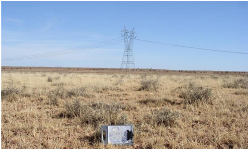
Figure 5. Clayey Upland 10-14" p.z.

This site has a plant community made up primarily of mid and short grasses with a relatively small percentage of shrubs and forbs. There is a mixture of both cool and warm season grasses. The plant community is dominated by grasses, which make up about 75% of the plant community by weight, forbs make up about 5%, shrubs make up about 20% with an occasional tree.