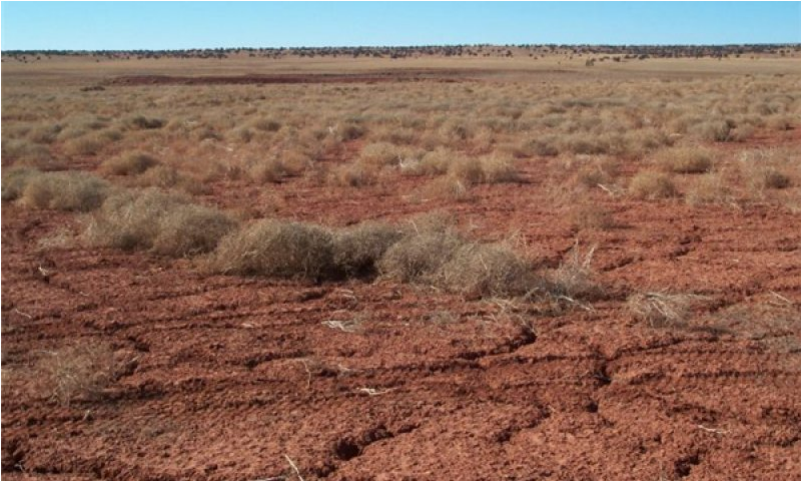
Figure 11. 2.1 Plant Community

This state is a grassland/shrubland plant community with a moderate amount of native and non-native annuals in the plant community.