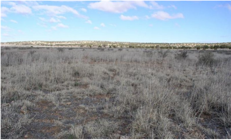
Figure 5. Clay Loam Upland 10-14" p.z.

Site has a plant community made up primarily of mid and short grasses, forbs, small shrubs and scattered junipers. In the original plant community there is mixture of both cool and warm season grasses with a predominance of warm season. Plant species most likely to invade or increase when this site starts to deteriorate are wooly groundsel, broom snakeweed, annuals and juniper. Continuous grazing use during the winter and spring periods will decrease the cool season grasses, which are replaced by warm season, lower forage value grasses and shrubs.