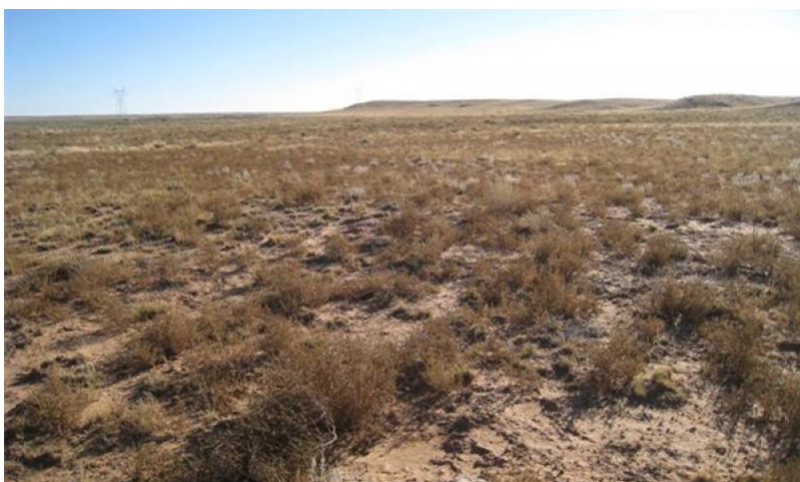
Figure 8. Loamy Upland - Invasive Annuals