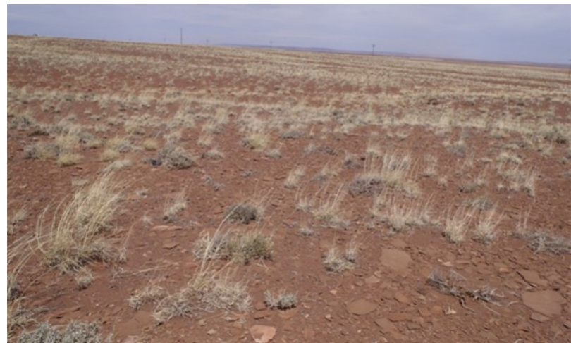
Figure 5. Sandstone/Shale Upland 6-10" p.z.

This site has a plant community made up primarily of short and mid grasses with a moderate amount of shrubs. The plant community has a mixture of both cool and warm season plants.