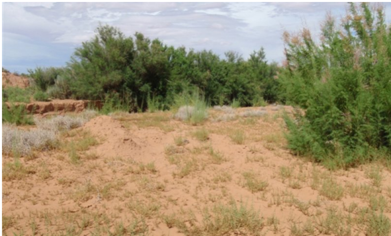
Figure 12. Sandy Wash - Tamarisk