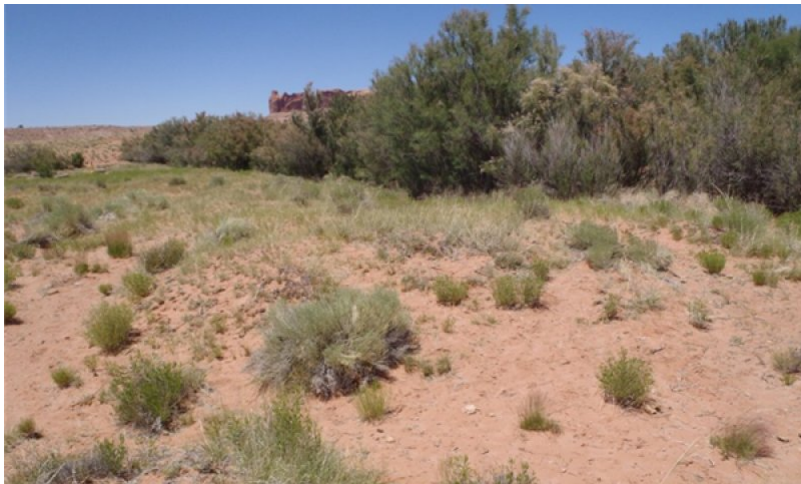
Figure 11. Sandy Wash - Tamarisk