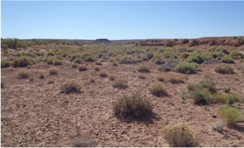
Figure 8. Sandy Wash - Shrubs, rarely flooded