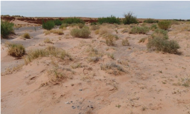
Figure 10. Sandy Wash - Shrubs, occasionally flooded

This plant community is a shrubland that includes rubber rabbitbrush and fourwing saltbush with sparse perennial grasses. A loss of biotic integrity and hydrologic function thru the loss of perennial grass cover and incised channels. The site begins to dry and shrubs increase, especially deep rooted shrubs. Bare ground increases and allows for accelerated wind and water erosion, promoting deposition and sedimentation.