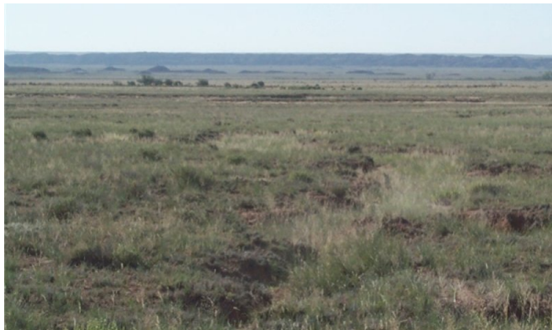
Figure 5. Sandy Wash 6-10" p.z. Grassland

This grassland dominated plant community has a mixture of both cool and warm season grasses, with scattered shrubs. Dominant grasses are western wheatgrass and Indian ricegrass with scattered alkali sacaton and squirreltail. Common shrubs that occur across the site along drainageways are fourwing saltbush, rubber rabbitbrush and Bigelow sagebrush. The occasional cottonwood may be present where a seep or a higher water table due to shallow bedrock depth occurs. Plant species most likely to invade or increase on this site when it deteriorates are salt cedar, rabbitbrush, and russian thistle. As erosion occurs, the benefits of over bank flooding are significantly reduced and results in a decline of grass cover and an increase in shrub species.