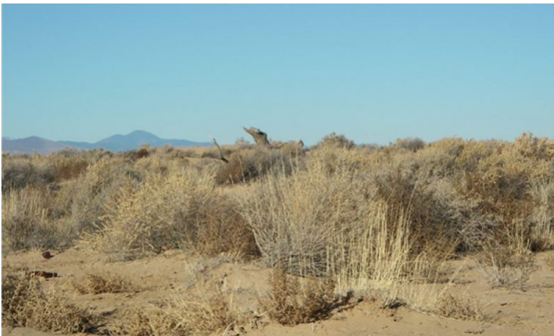
Figure 9. Sandy Wash - Shrubs, rarely flooded