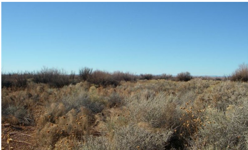
Figure 13. Sandy Wash - Tamarisk with shrubs

This plant community is dominated by tamarisk and/or Russian olive as the overstory. The understory is dominated by shrubs such as rubber rabbitbrush and fourwing saltbush with only patches of perennial grasses. Native and non-native annuals are also present in the understory. This state is caused by heavy disturbance along the channel such as changes in stream flow and width, drought, and unmanaged grazing. Unmanaged grazing on site and on adjacent uplands produces increased surface runoff and sediments. Channelized flows accelerate channel scour, gully erosion and creates abandoned floodplains. Deep channels form and promote the establishment of exotic tree species thru seed sources from adjacent washes and rivers. The site has the potential to burn and promote further Tamarisk invasion.