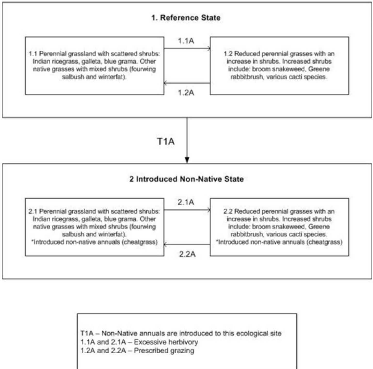
Figure 4. Sandy Terrace 6-10" p.z. State and Transition Mode