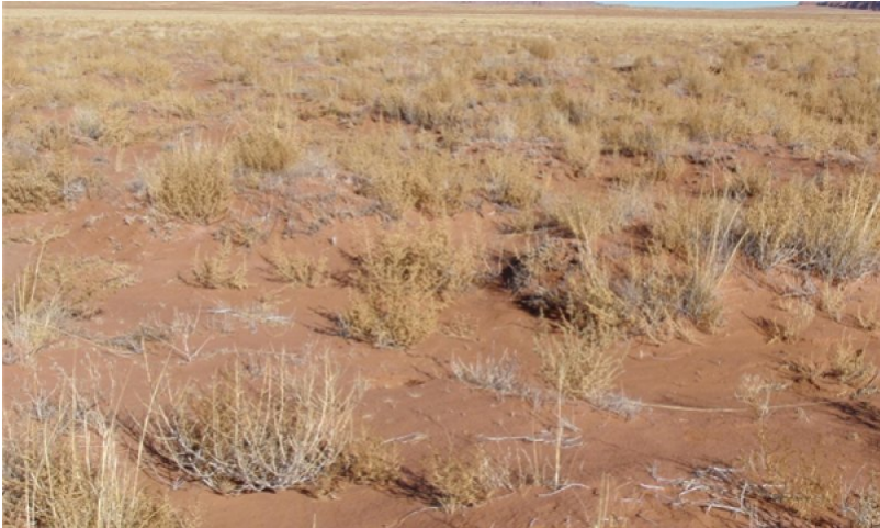
Figure 7. Grassland Community with Exotic Annuals

This plant community is characterized as a grassland with a reduction in native perennial grasses and introduced non-native annuals. Shrubs species such as Mormon tea, rubber rabbitbrush and broom snakeweed are likely to increase on the site.