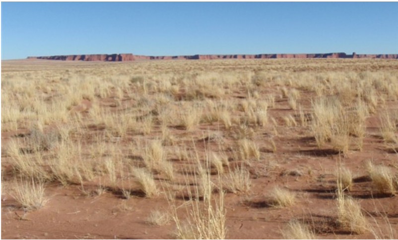
Figure 5. Sandy Upland 6-10" p.z. Sodic

This site is characterized as a perennial grassland with both warm and cool season grasses and scattered shrubs and forbs. Dominant warm season grasses are alkali sacaton and dropseeds with some galleta. Cool season grasses present are Indian ricegrass and squirreltail. Fourwing saltbush is the most common shrub, with Mormon tea and rubber rabbitbrush also occurring on the site. This site may have a minor amount of non-native annuals present (<5%) in the community.