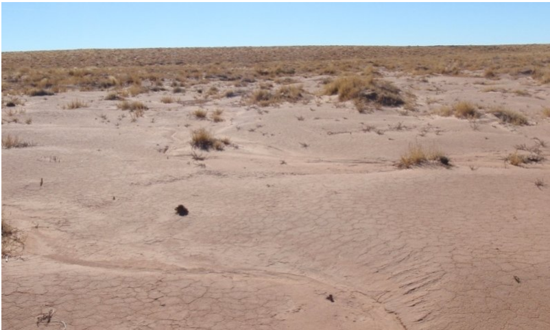
Figure 9. Disturbed Site

The factors that may contribute to a disturbed state include prolonged drought, unmanaged grazing, off road vehicle use, and other possible disturbances. There is a loss of soil surface stability and hydrologic function as perennial herbaceous cover is removed. The soil surface has been severely degraded or lost, exposing the more sodic soil layer. This plant community has lower capability to capture and store moisture and now erodes readily.