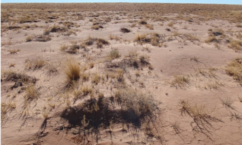
Figure 10. Disturbed surface - scattered grasses and annuals

Scattered shrubs and native and non native grasses and forbs occur on the more stable areas. Low site resistance to erosion. The site has active wind erosion and dune forming processes occurring.