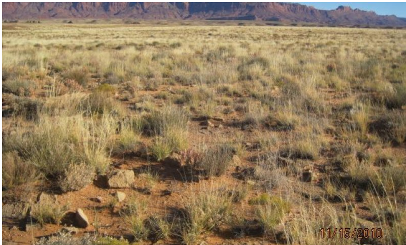
Figure 8. R035XB233AZ Slightly Above Average Precipitation

The dominant aspect of this site is a shrub-grassland. Shadscale saltbush dominates both the visual aspect and the production in pounds of the site. Several other shrubs, including Ephedra and several cactus species are common, but make up only a small proportion of the aspect. Perennial grasses, both warm and cool season, are common, but sub-dominate to shadscale saltbush. Common warm season grasses include sand dropseed and galleta. Common cool season grasses include Indian ricegrass and squirreltail. The occurrence and production of sand dropseed may be expected to decrease in years of below average warm season precipitation and increase in years of above average precipitation. The same can be expected of squirreltail except a decrease would be the result of below average cool season precipitation and an increase due to above average cool season precipitation. Exotic annuals occur in minor amounts. Cool season annuals, including exotic annuals, may increase as a result of above average cool season precipitation and decrease as a result of below average cool season precipitation.