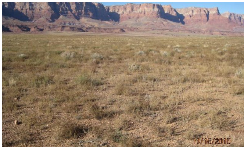
Figure 16. R035XB233AZ with Severe Russian Thistle Invasion