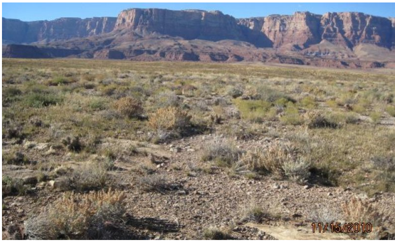
Figure 7. R035XB233AZ Interspersed Rock Outcrop