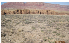
Globemallow/shadscale saltbush/perennial warm and cool season grasses/native and exotic annuals