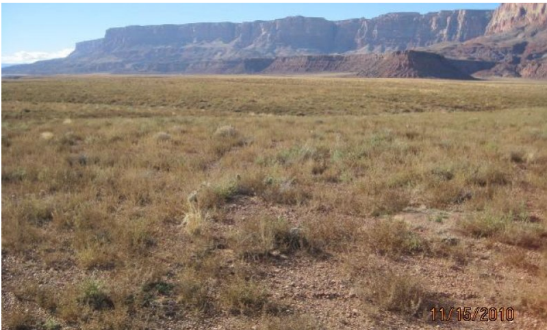
Figure 18. R035XB233AZ with Severe Russian Thistle Invasion

The dominant aspect of this site is a shrub-grassland. Shadscale saltbush dominates both the visual aspect and the production in pounds of the site. Several other shrubs, including Ephedra and several cactus species are common, but make up only a small proportion of the aspect. Perennial grasses, both warm and cool season, are common, but sub-dominate to shadscale saltbush. Annuals, including exotic annuals, and unpalatable perennial plants have become a major component, possibly more common than perennial grasses.