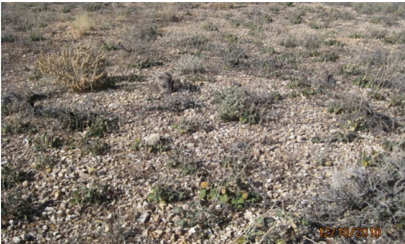
Figure 21. Plant Community Phase 2.3 Closeup 2

Globemallow, acting as a pioneer plant, has filled the void left by the shrubs and perennial warm and cool season grasses killed by prolonged drought.