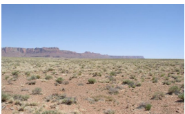
Shadscale saltbush/perennial warm and cool season grasses/native and exotic annuals