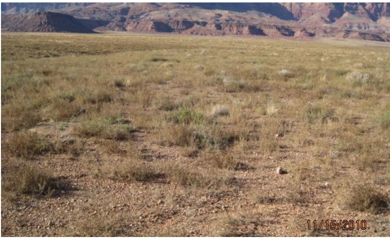
Figure 17. R035XB233AZ with Severe Russian Thistle Invasion