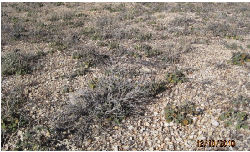
Figure 20. Plant Community Phase 2.3 Closeup 1