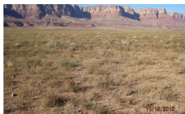
Shadscale saltbush/exotic and native annuals/perennial warm and cool season grasses

Severe extended drought or/and extreme herbivory combined with severe soil surface disturbance weakens perennial plants providing annuals and unpalatable and drought tolerant perennial plants a competitive edge.