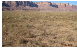
Shadscale saltbush/exotic and native annuals/perennial warm and cool season grasses