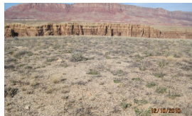
Globemallow/shadscale saltbush/perennial warm and cool season grasses/native and exotic annuals