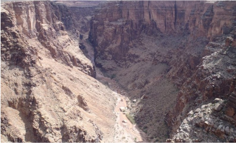
Figure 5. Limestone/Sandstone Cliffs 6-10" p.z.

This plant community is a diverse shrubland with grasses and a few forbs. The dominant plants are: shadscale saltbush, black grama, Bigelow sagebrush, Torrey Mormon tea, and fourwing saltbush. There is 2-10% plant basal cover and 10-45% plant canopy cover on the site. Cover is highly variable depending on amount of rock cover, slope and aspect. The production amount varies depending upon how much rock outcrop and the aspect of the site. The maximum production amount of 350 pounds per acre may only occur in areas with the highest amount of soil and the least amount of rock outcrop.