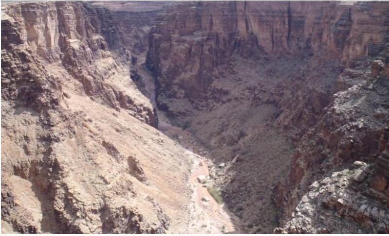
Figure 5. Limestone/Sandstone Cliffs 6-10" p.z.

This plant community is a diverse shrubland with grasses and a few forbs. The dominant plants are: shadscale saltbush, black grama, Bigelow sagebrush, Torrey Mormon tea, and fourwing saltbush. There is 2-10% plant basal cover and 10-45% plant canopy cover on the site. Cover is highly variable depending on amount of rock cover, slope and aspect. The production amount varies depending upon how much rock outcrop and the aspect of the site. The maximum production amount of 350 pounds per acre may only occur in areas with the highest amount of soil and the least amount of rock outcrop.