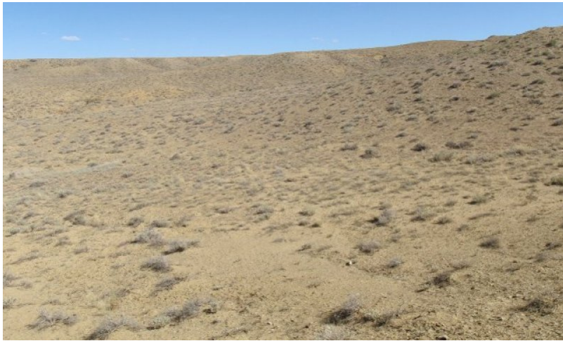
Figure 5. Shale Hills 6-10" p.z.