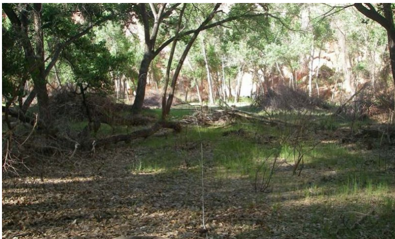
Figure 4. 35.2 Sandy Bottom

This site has a plant community made up primarily of mid grasses, shrubs and Fremont cottonwood trees. Forbs are a minor component of the site. Plant species most likely to invade or increase on this site when it deteriorates are cheatgrass, annual weeds, threadleaf rubber rabbitbrush, tamarisk, Russian knapweed, camelthorn and Russian olive.