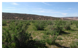
Black Greasewood Shrubland