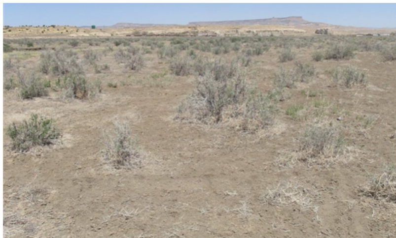
Figure 12. Gullied Site

This site is characterized by active gullies and deep incised channels with a black greasewood plant community. The dominant shrub is greasewood with a understory of annuals and very few scattered alkali sacaton and galleta. Common annuals include annual wheatgrass, globemallow, springparsley, stickseed, tansymustard, butterwort, goosefoots, sixweeks fescue, cheatgrass, filaree and Russian thistle.