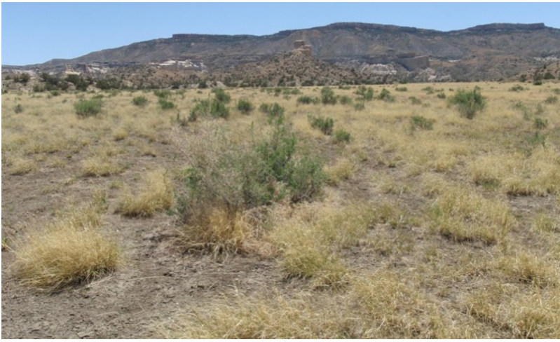
Figure 5. Clay Loam Terrace 10-14" p.z.

The dominant aspect of this site is a grass-shrub mix dominated by western wheatgrass, alkali sacaton, fourwing saltbush with scattered black greasewood. Other important grass species include Indian ricegrass, James' galleta, and squirreltail. The plant species most likely to increase or invade on this site are cheatgrass, Russian thistle, annual weeds, broom snakeweed, Greene rabbitbrush, rubber rabbitbrush, and black greasewood. Continuous grazing and drought conditions will decrease preferred herbaceous cover (cool season grasses), which is replaced by lower forage value grasses, forbs, and shrubs. A decrease in cool season grasses and increase of bare ground favor the establishment of annual weeds and shrubby species.