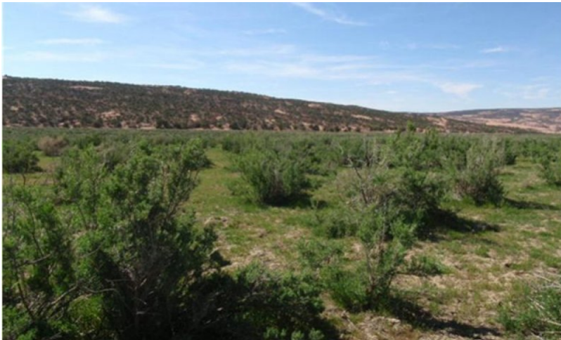
Figure 10. Greasewood Site

The dominant aspect of this plant community is a greasewood shrubland with lesser amounts of fourwing saltbush and rabbitbrush. The understory is dominated by alkali saccation, galleta along with increased annuals such as annual wheatgrass, mustards, buckwheats and globemallow.