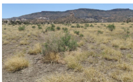
Reference Plant Community