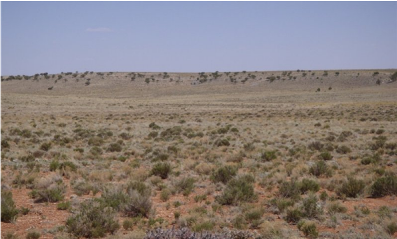
Figure 7. Increased Shrubs

1.2 Shrubs have increased and have become co-dominant to dominant. Broom snakeweed and Greene rabbitbrush increase the most. Most of the grass species production is reduced, especially cool season grasses.