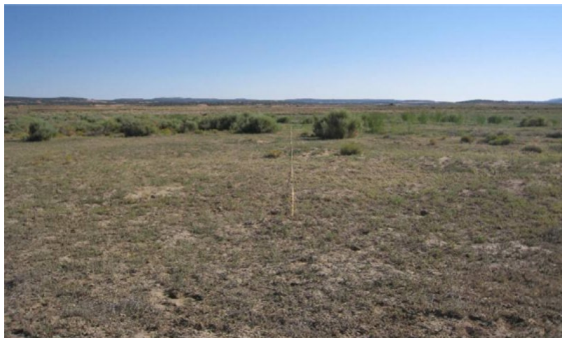
Figure 7. 2.1 Plant Community

2.1 If left unmanaged from continuous grazing, undesirable exotic plant species will establish and continue to increase in the understory. Introduced invasive species most likely to establish themselves when the site deteriorates are prickly Russian thistle, weed Kochia, cheatgrass, filaree and other exotic annuals. There will be a low component of these exotic annuals in the understory, and beginning the process of exotic annuals establishing themselves on site. COMMUNITY PATHWAY: 2.1A: Continuous yearlong grazing/ Drought/ Decrease of perennial grass cover/ Higher bare ground/ Active erosion