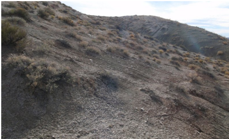
Figure 13. Shrubs with Few Grasses

This plant community is characterized by a dominance of shadscale saltbush, Torrey Seepweed, snakeweed, with a few alkali sacaton and galleta. Introduced exotic annual grasses and forbs are present in minor amounts in the plant community.