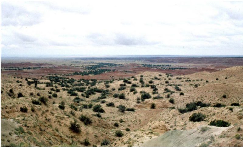
Figure 5. 35.3 Shale Hills - Low Elevation Site