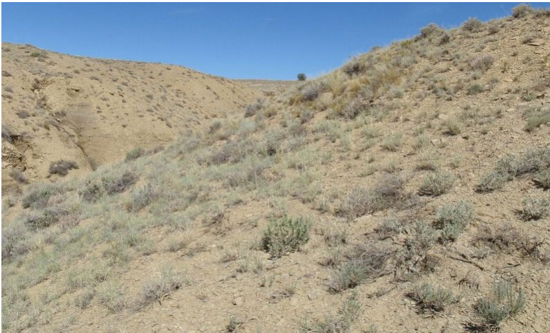
Figure 6. Shale Hills 10-14" p.z.

The plant community is made up of mid and short grasses with a fair percentage of forbs and shrubs. In the original plant community, there is a mixture of both cool and warm season plants. Plant species most likely to invade or increase on this site when it deteriorates are galleta, Torrey seepweed, Greene rabbitbrush, cheatgrass and annual forbs. Continuous livestock grazing use during winter and spring will decrease cool season grasses, which are replaced by lower forage value grasses and shrubs.